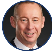
Andy Williams UK